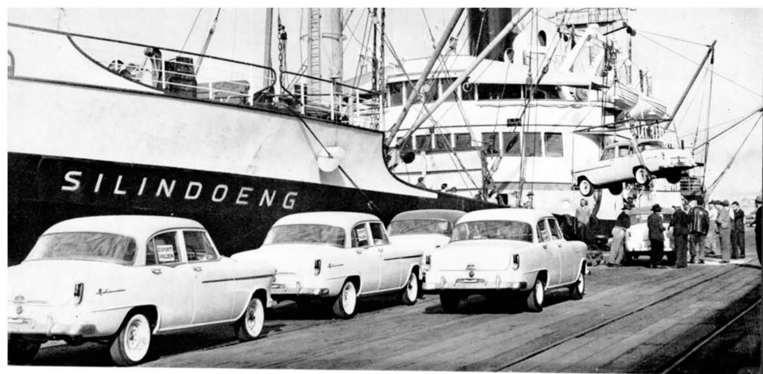
ABOVE: On their way for overseas distributors. Holden sedans being loaded at Port Melbourne.