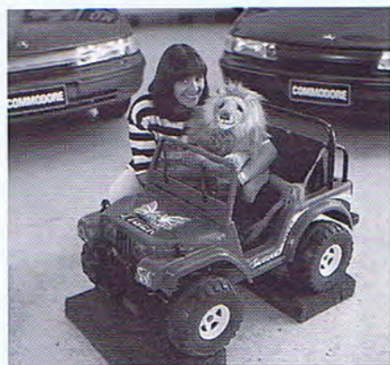
Media personality, Denise Drysdale, will be featured in a community service announcement running nationally on the 9 network from Nov 18-Dec 6.

The collection bins will be in place in dealerships and Holden workplaces including the Tech Centre foyer at the 'Bend, the HSPO admin building foyer and Elizabeth main foyer. Afternoon shift employees at Elizabeth can deposit their toys up to 5.50 pm weekdays. Please donate a new toy if you can.